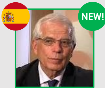
Josep Borrell Centre-Left (S&D)

Josep Borrell was nominated as the next EU High Representative overseeing Foreign Affairs and Security Policy. No stranger to Brussels, Borell was an MEP from 2004 to 2009, during which time he served as President of the European Parliament and Chairman of the Committee on Development.