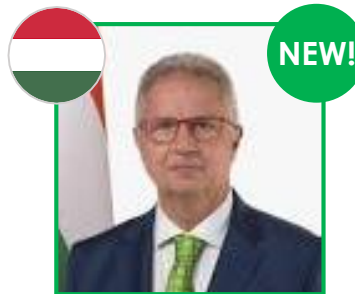
László Trócsányi Centre-Right (EPP)

Trócsányi served as a Hungarian Ambassador from 2000 to 2014 (to Belgium, Luxembourg and France). In 2014, he decided to quit the diplomatic career to serve as Justice Minister in Viktor Orbán's government. He was elected as an MEP in the 2019 elections, and obtained a seat in the Foreign Affairs Committee.