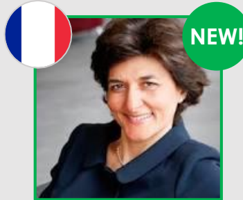
Sylvie Goulard Liberal (Renew Europe)

First starting her EU career in 2001 by becoming a political advisor to European Commission President Romano Prodi, Sylvie Goulard then served as a centrist MEP from 2009 to 2017. She was coordinator for the ALDE group within the Committee on Economic and Monetary Affairs (ECON). After a very short experience as French Minister of Armed Services (2017), she was appointed Deputy Governor of the French central bank (2018). She is a strong Europhile and a founding member of the Spinelli Group.