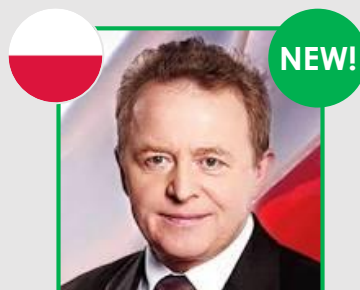
Janusz Wojciechowski Conservative (ECR)

Wojciechowski was a long-standing Member of the European Parliament (2004-2016), focusing his works on agricultural matters and policies. In 2015, he was nominated by the Polish government as a representative of Poland at the European Court of Auditors.