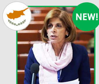
Stella Kyriakides Centre-Right (EPP)

Stella Kyriakides currently serves as Member of Cyprus' House of Representatives. A clinical psychologist by training, she is a long-standing campaigner on breast cancer and has worked on health policy issues in the Cypriot legislature. She has been the delegation leader of the House to the Parliamentary Assembly of the Council of Europe (PACE) since 2012, and a member of the Bureau since 2016. Following the resignation of Pedro Agramunt in 2017, she was elected President of PACE, and served until January 2018.