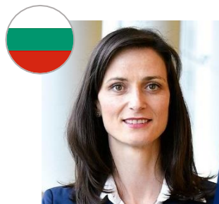
Mariya Gabriel Centre-Right (EPP)

Once again, a familiar face. In the beginning, Mariya Gabriel was elected to the European Parliament for two consecutive mandates, 2009-2014 and 2014-2017. However, during the previous term (2017) she was appointed as the commissioner for the Digital Economy and Society – replacing Kristalina Georgieva who resigned to join the World Bank.