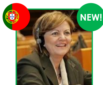
Elisa Ferreira Centre-Left (S&D)

Former MEP(2004-2016), Ferreira was Rapporteur of the European Parliament's position on various legislative proposals related to the financial system as well as on several economic, budgetary and tax policy matters. In 2016, she resigned from the European Parliament after she was nominated to join the board of directors of the Bank of Portugal. She was then appointed vice-governor of the same institution.