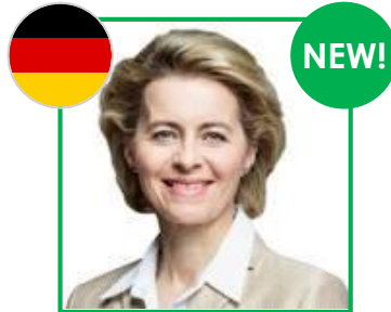
Ursula von der Leyen Centre-Right (EPP)

Ursula von der Leyen was elected by the European Parliament to be President of the European Commission, with a majority of only 9 votes. Before her nomination, she served as German Defence Minister under Chancellor Angela Merkel (2013-2019). Prior to this, she served as the Minister for Labour and Social Affairs (2009-2013) and Family Affairs (2005-2009).