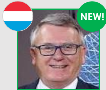
Nicolas Schmit Centre-Left (S&D)

Schmit is a politician of the Luxembourg Socialist Workers' Party (LSAP) and a long-serving member of the Luxembourg Government (2004-2018). Throughout his career, Schmit worked in the fields of International Relations, Economics and Employment. Schmit was elected as a Member of the European Parliament in July 2019.