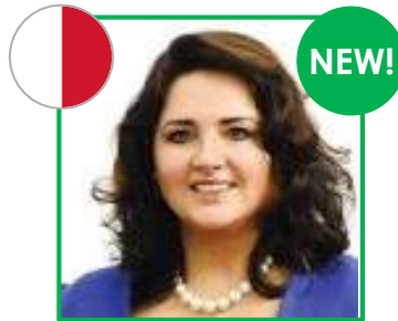
Helena Dalli Centre-Left (S&D)

Dalli is called a champion of human rights and gender equality having focused her political career on defending those notions. In Malta, she has held the positions of Minister for Social Dialogue, Consumer Affairs and Civil Liberties (2013-2017) and Minister for European Affairs and Equality (2017-2019).