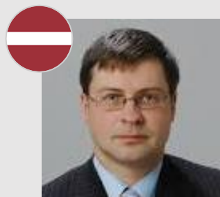
Valdis Dombrovskis Centre-Right (EPP)

Valdis Dombrovskis was the European Commission Vice President for Euro and Social Dialogue under President Jean-Claude Juncker. He was also in charge of Financial Stability and Services, and Capital Markets Union. He will return for a second term.