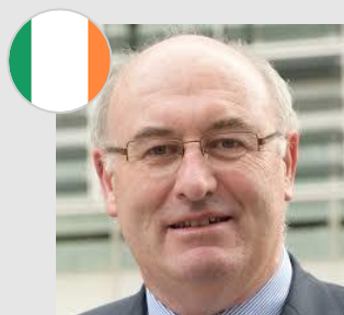
Phil Hogan Centre-Right (EPP)

Phil Hogan is a thirty-year veteran of local and national politics representing Fine Gael (FG; EPP), holding such positions as chair of the parliamentary branch and Director of Elections. He was Commissioner for Agriculture and Rural Development under President Jean-Claude Juncker. Most of his efforts went into streamlining the CAP and working on food supply chain reforms. He faced controversy in Ireland in 2019 for signing the EU-Mercosur trade agreement.