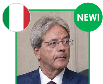
Paolo Gentiloni Centre-Left (S&D)

Paolo Gentiloni might be considered an 'old seadog' of Italian politics. He served as Minister for Communications for Romano Prodi's second government (2006-2008). In 2014, he was appointed Minister of Foreign Affairs by Prime Minister Matteo Renzi, replacing Federica Mogherini. In 2016, following the collapse of the government, Gentiloni managed to win the support of the Parliament and led a coalition government until 2018, when he was succeeded by Giuseppe Conte.