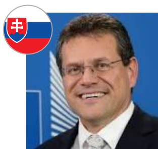
Maroš Šefčovič Centre-Left (S&D)

Interinstitutional Relations and Foresight