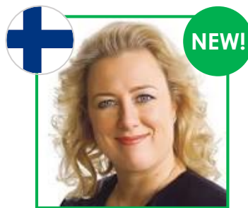
Jutta Urpilainen Centre-Left (S&D)

Following the demands for gender balance in this new European Commission, the Finnish Government's choice to nominate Jutta Urpilainen as the first Finnish female Commissioner does not come as a surprise considering her background in breaking glass ceilings: first female Minister of Finance of Finland and the first female president of the Social Democratic Party (2008-2014).