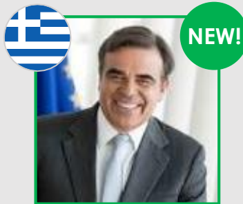
Margaritis Schinas Centre-Right (EPP)

A familiar face for anyone who has attended one of the European Commission's press briefings in recent years. Margaritis Schinas was the Commission's spokesperson under President Jean-Claude Juncker. A Greek civil servant, he has held many posts at the European Commission since 1990, including chief of staff for the Cypriot Commissioner, and Director at the Commission's Directorate General for Economic and Financial Affairs. He was previously an MEP from 2007 to 2009.