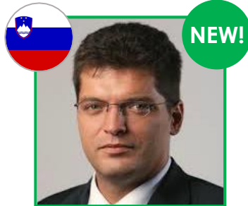
Janez Lenarčič Not affiliated / Close to Liberal (Renew Europe)

Janez Lenarčič has been a Slovenian professional diplomat with nearly three decades of experience. In his early career he worked, inter alia, at the Permanent Mission of Slovenia to the United Nations and as an Adviser to the Foreign Minister and Prime Minister of Slovenia. In 2014, he came to Brussels to serve as the Ambassador Extraordinary and Plenipotentiary Permanent Representative (Coreper II).