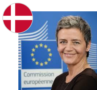
Margrethe Vestager Liberal (Renew Europe)

Margrethe Vestager, from the Danish liberal party, has served as the European Commissioner for Competition since 2014, under President Jean-Claude Juncker. During this mandate, she focused on state aid & tax cases, and has gone after big tech companies in an unprecedented way. She will keep the Competition portfolio in her new position.