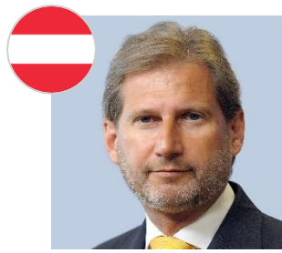
Johannes Hahn Centre-Right (EPP)

No stranger to high EU office responsibilities, Hahn was the European Commissioner for Neighborhood policy and enlargement under President Jean-Claude Juncker. Before that, he was in charge of the Regional Policy portfolio under Barroso II (2010-14). His nomination is a sign for political continuity given by Austria's interim Chancellor, following the recent collapse of the Austrian government. He spent the beginning of his career in the private sector.