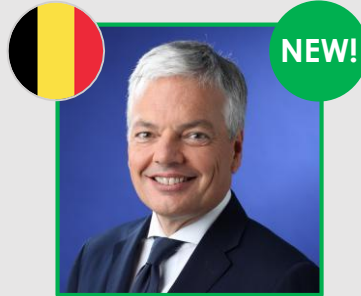
Didier Reynders Liberal (Renew Europe)

Reynders served as Belgian Minister of Foreign Affairs and European Affairs from 2014 and Minister of Defense from 2018. However, he has been present in the Belgian political landscape for many years now – being a minister without interruption since 1999. Amongst his other portfolios were for instance Finance until 2011, and Trade.