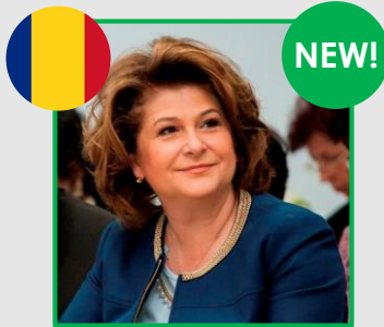
Rovana Plumb Centre-Left (S&D)

Rovana Plumb has been a Member of the European Parliament since 2007 and Vice President of the Group of the Progressive Alliance of Socialists and Democrats since 2011. Before this, she was a Member of the Chamber of Deputies of the Romanian parliament from 2004 to 2007.