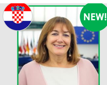
Dubravka Šuica Centre-Right (EPP)

Dubravka Šuica has held several positions (Vice President of EPP Women, President of the Congress of Local and Regional Authorities of the Council of Europe, Mayor of Dubrovnik) before joining the European Parliament in 2013. Since 2013, in the European Parliament, Dubravka Šuica has been dealing with the issues of environment, public health and food safety as well as foreign affairs. She was subsequently re-elected in 2019.