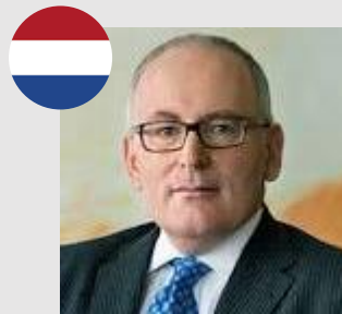
Frans Timmermans Centre-Left (S&D)

Frans Timmermans has held the position of First Vice-President of the European Commission since 2014, under President Jean-Claude Juncker. Prior to this, he served as the Netherlands' Minister for Foreign Affairs (2012-2014), and a Dutch Member of the House of Representatives. Before entering politics, Timmermans worked in the Dutch Ministry of Foreign Affairs. He is known for being fluent in French, English, German, Italian and Russian, in addition to Dutch.