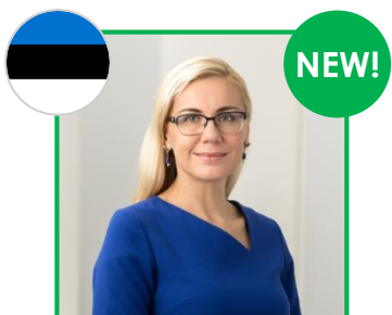
Kadri Simson Liberal (Renew Europe)

Simson was the Minister of Economic Affairs and Infrastructure for Estonia (2016-2019). She has been very active during the Estonian Presidency of the Council of the EU as she headed three major different formations (competitiveness, energy and transport). Simson was put forward by the Estonian Government to replace outgoing Andrus Ansip (Vice-President for the Digital Single market) – who took up his seat in the European Parliament – already in the Juncker Commission.